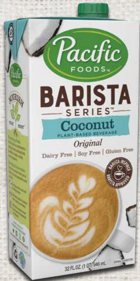
Coconut Original Item#: 04313