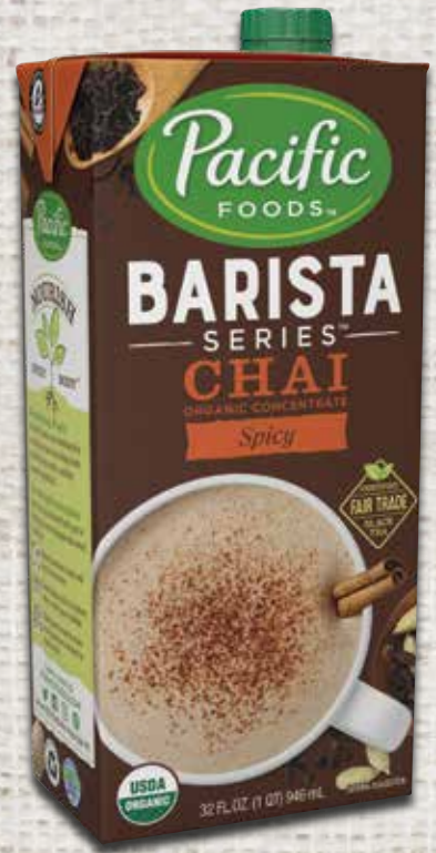
Organic Chai - Spicy Item#: 03483

†FAIR TRADE CERTIFIED™ BY FAIR TRADE USA