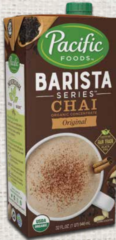
Organic Chai - Original Item#: 03482