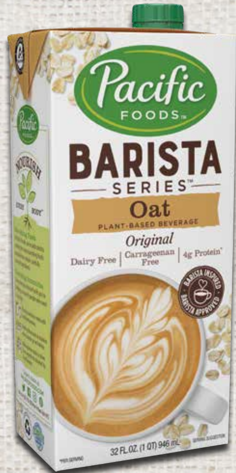
Oat Original Item#: 04320