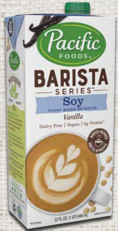
Soy Vanilla Item#: 04294