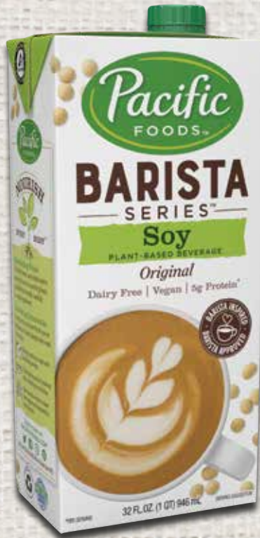
Soy Original Item#: 04292