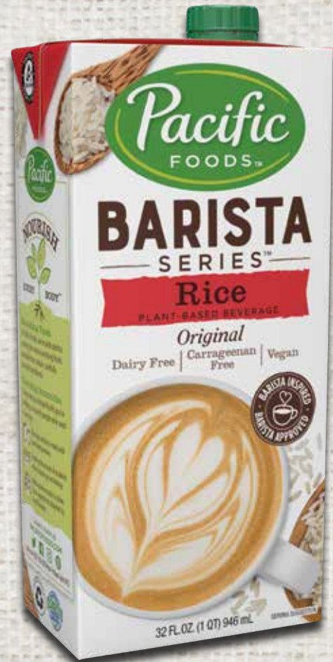
Rice Original Item#: 04314