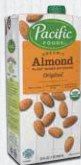
Organic Almond Original - 32oz