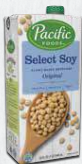
Select Soy Original - 32oz