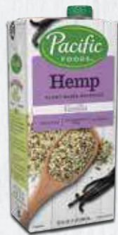
Hemp Vanilla - 32oz