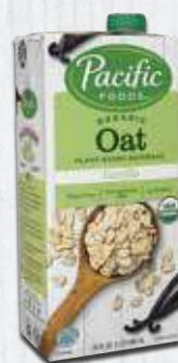
Organic Oat Vanilla - 32oz