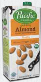
Organic Almond Vanilla - 32oz