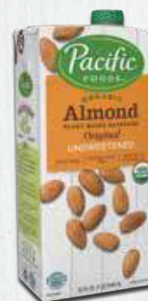
Organic Unsweetened Almond Original - 32oz