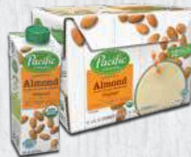
Organic Almond Original - 8oz single & 12-pack