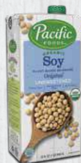
Organic Soy Original Unsweetened - 32oz