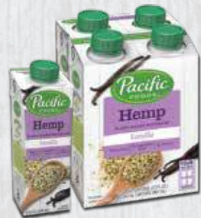
Hemp Vanilla - 8oz single & 4-pack