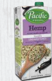
Unsweetened Hemp Vanilla - 32oz