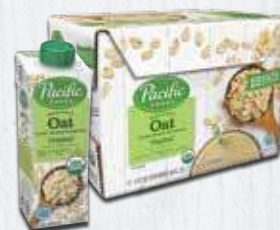
Organic Oat Original - 8oz single & 12-pack