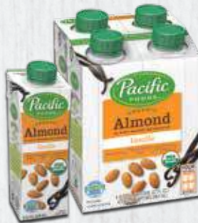
Organic Almond Vanilla - 8oz single & 4-pack