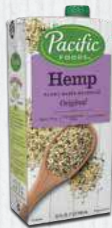
Hemp Original - 32oz