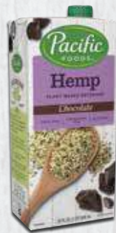
Hemp Chocolate - 32oz