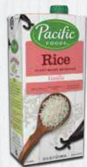
Rice Vanilla - 32oz

INGREDIENTS: WATER, RICE, CONTAINS 1% OR LESS OF: GELLAN GUM, HIGH OLEIC SUNFLOWER OIL, NATURAL FLAVOR, RICE BRAN, SEA SALT, TRICALCIUM PHOSPHATE, VITAMIN D2, XANTHAN GUM.