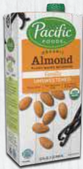
Organic Unsweetened Almond Vanilla - 32oz