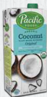
Organic Coconut Original - 32oz