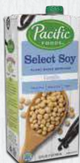
Select Soy Vanilla - 32oz