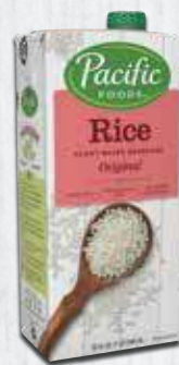
Rice Original - 32oz