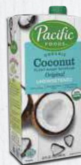
Organic Unsweetened Coconut Original - 32oz