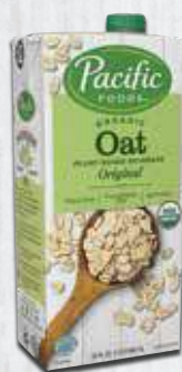
Organic Oat Original - 32oz