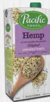
Unsweetened Hemp Original - 32oz

INGREDIENTS: WATER, BROWN RICE SYRUP, HULLED HEMP SEED, CONTAINS 1% OR LESS OF: DISODIUM PHOSPHATE, TRICALCIUM PHOSPHATE, VITAMIN D2, XANTHAN GUM.