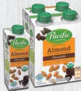
Organic Almond Chocolate - 8oz single & 4-pack