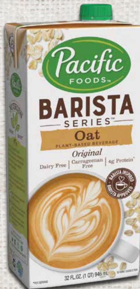
Oat Original Item#: 04320

WINNER BEST NEW PRODUCT 2018 SPECIALTY COFFEE ASSOCIATION SPECIALTY BEVERAGE FLAVOR ADDITIVE