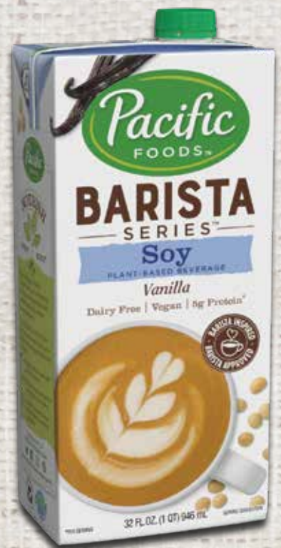
Soy Vanilla Item#: 04294