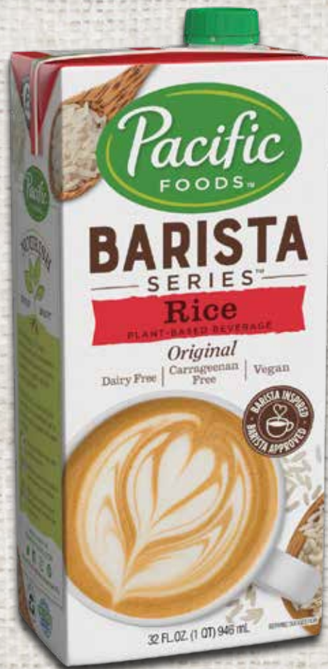
Rice Original Item#: 04314