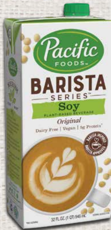
Soy Original Item#: 04292