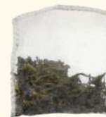
SEE-THROUGH MESH TEA BAGS