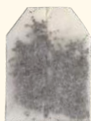
NUMI TEA BAGS

Through thoughtful choices we are committed to reducing our impact on the planet and have consciously chosen not to follow the trend of the see-through nylon or bio-plastic tea bags. Here's WHY :