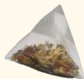
"SILKY" TEA BAGS